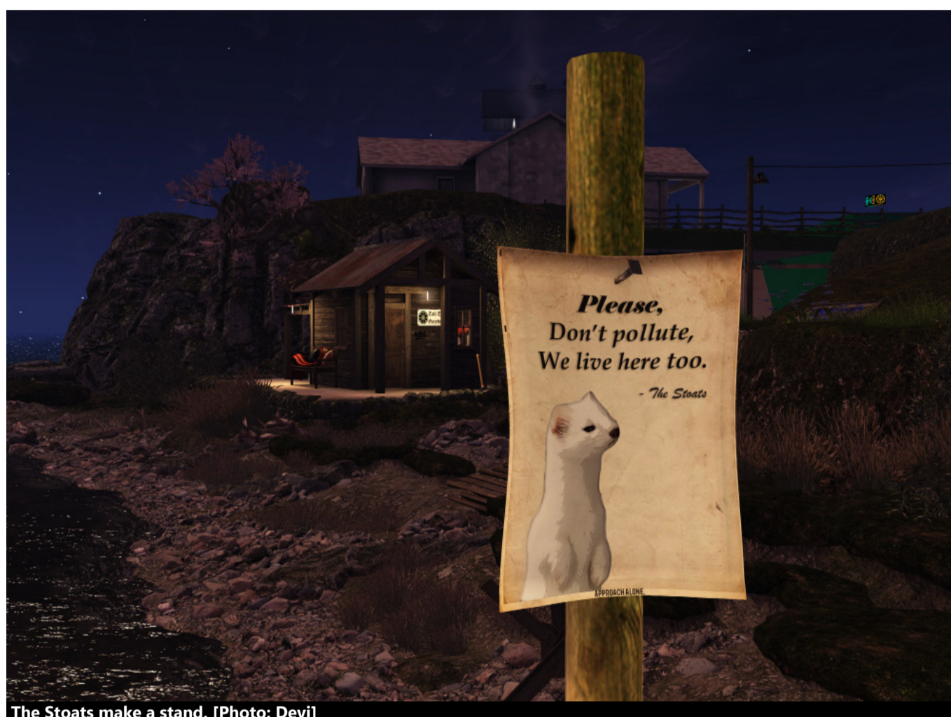
The Stoats make a stand.

Posters seen in the areas of the Meadows and the Pike proclaim the Stoats – mischievous hunters that live among us in the woods and grasslands – are alarmed at the appearance of cannon armed pony carts around the Meadows and the amount of debris and refuse building up in Pike and they appear to be ready to do something about it.