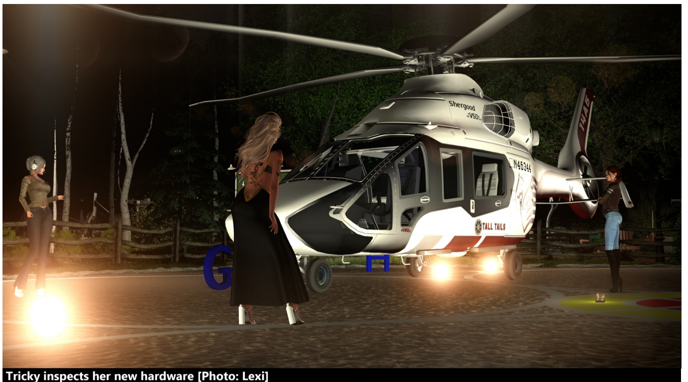
Tricky inspects her new hardware

Is a helicopter in the fleet now a mandatory component for a serious faction? Can we expect Stoat or TT Army helicopters soon? Stay tuned as the skies are filled with the sound of helicopter blades as the factions seek to out-machine each other. Fun!