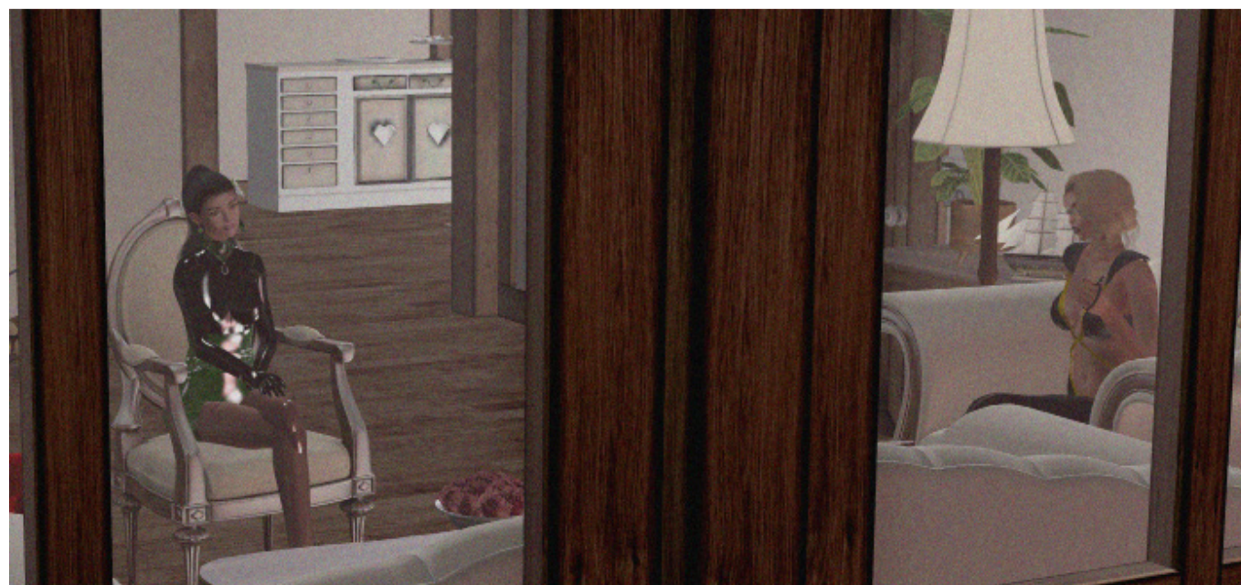
Top Secret conference