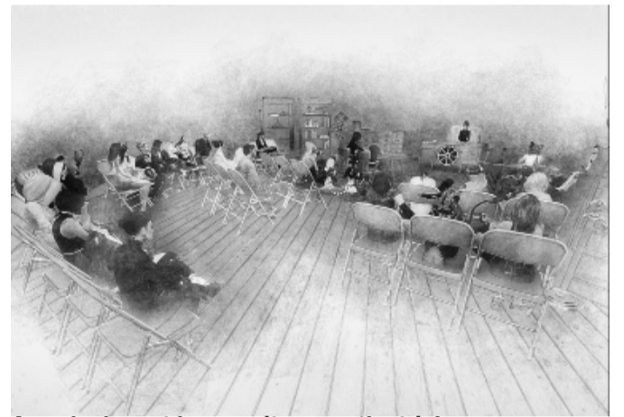
A packed court house witnesses the trial