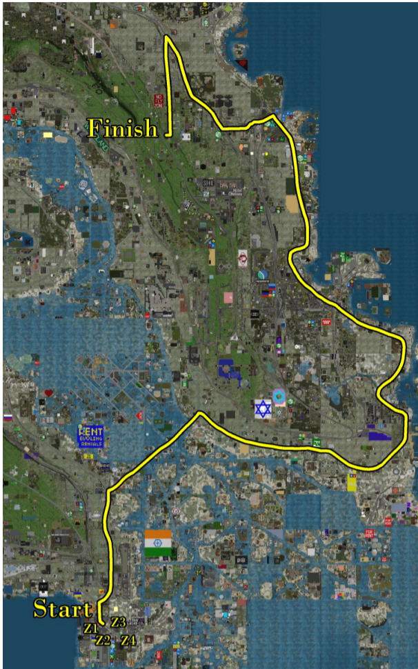
26 th Pony Caravan Route.

The route is on the continent of Heterocera, the same continent as the TT Orchard outpost.