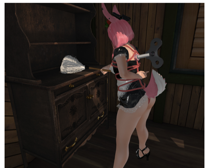
...and Berry is busy dusting.