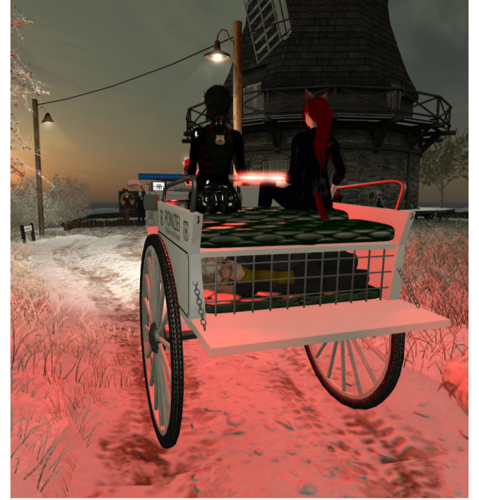
Cookie heads to court, pulled by Tessa.