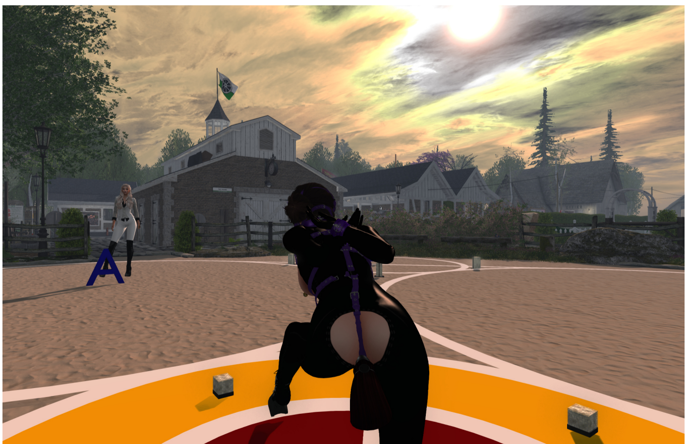
Pony Aurora is taken through her paces by Tricky Trouble at flower dressage.