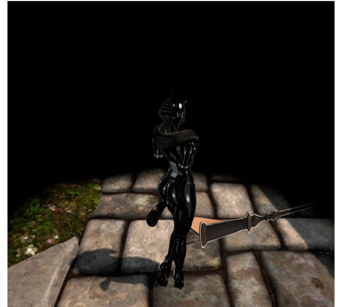
Scorpory breaks the lamp post...