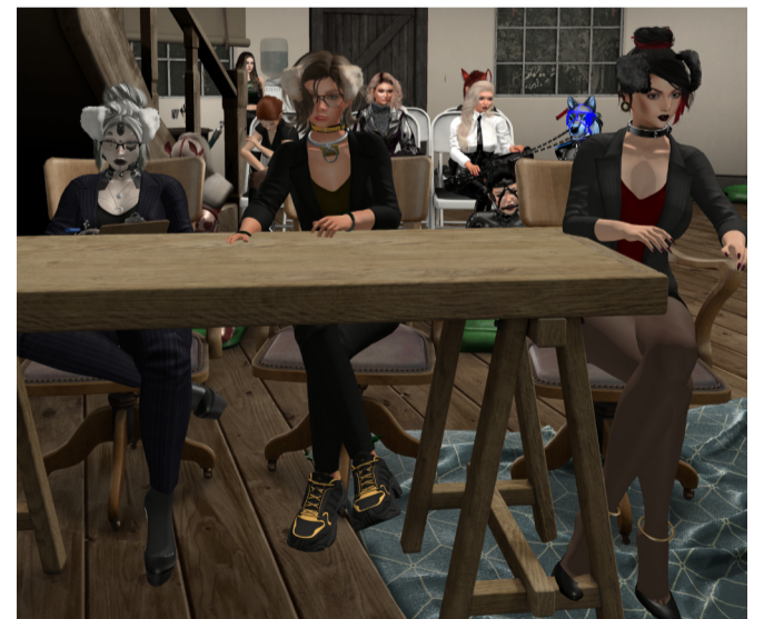
Cookie was defended by Ari and m4zi.