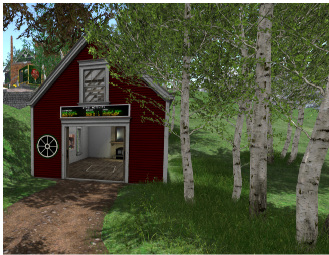
The TT Hub at Sabhal Dearg.

In case you didn't know, please be sure to check out this useful site which is a portal listing all the TT affiliated hubs around SL. We have visited others in previous editions so this time I have decided to visit Sabhal Dearg. This is a nice little hub close the the LL road. In terms of location, it is on Route 9A, north of the TT Glue Factory. It also features at GTF0 hub so you can pick up and drop off those important deliveries.