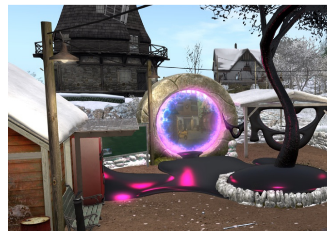
Glue enters the estate via the portal.