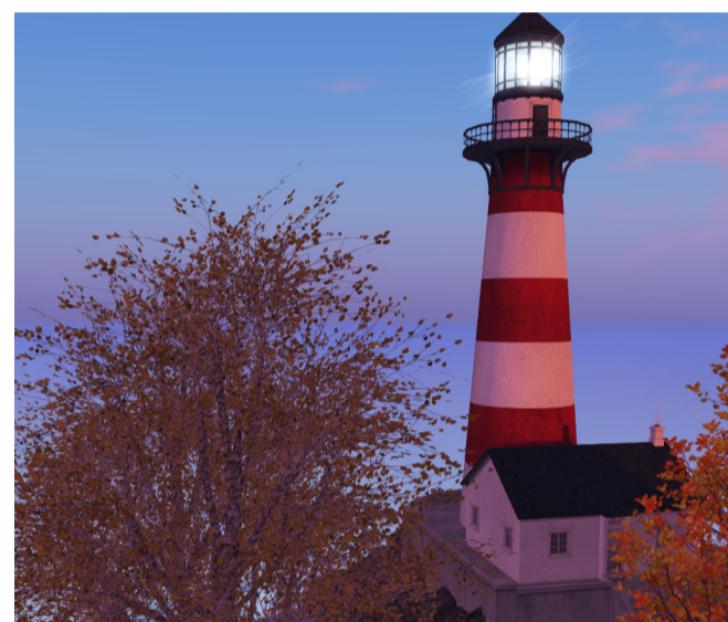
It's still a lighthouse. It's still available!

Its still available, so you can still be the proud owner of the biggest light on Tall Tails!