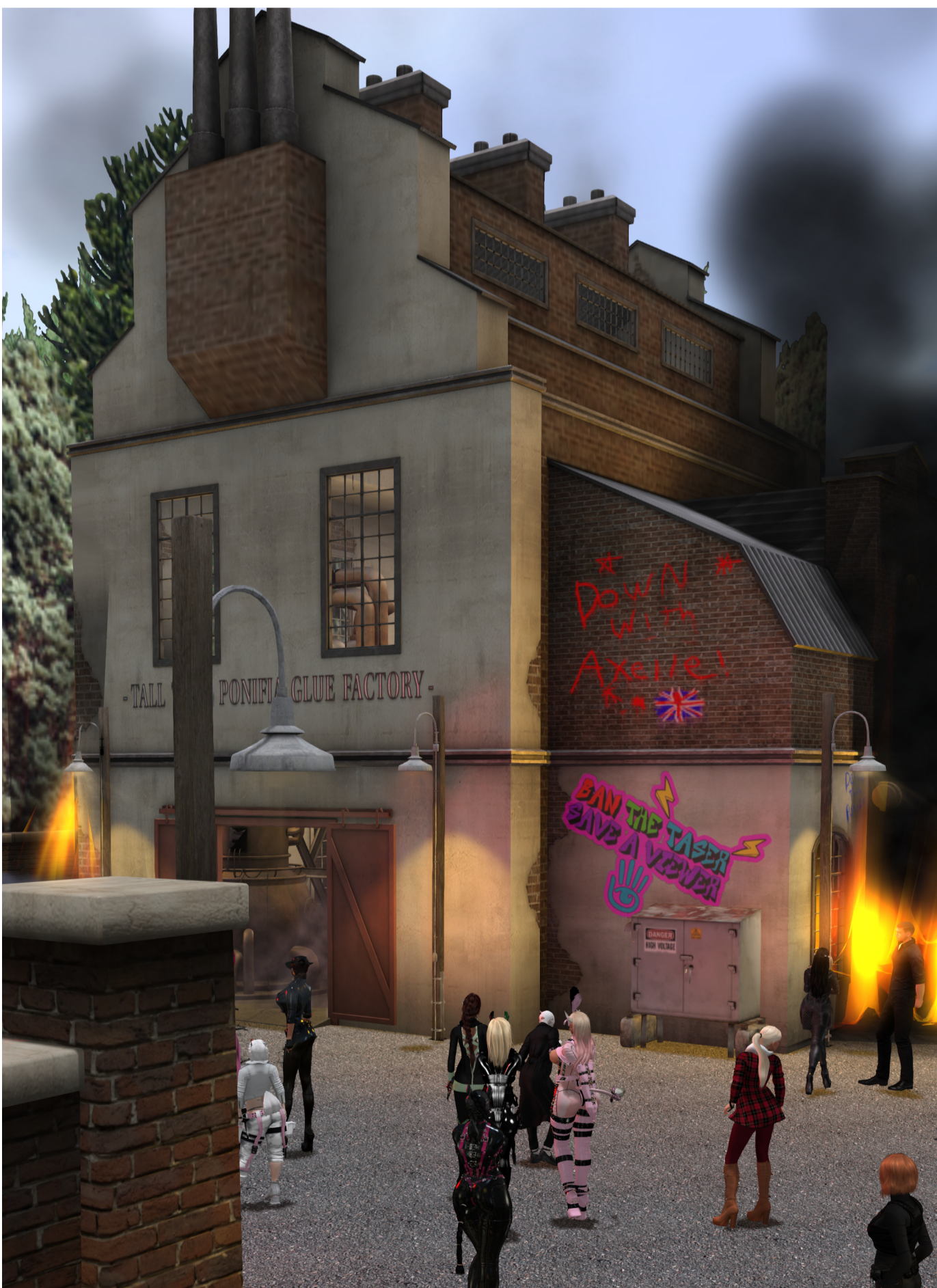
A huge fire erupts at the Ponifia Glue Factory after the GTFO event. I wonder how this happened?