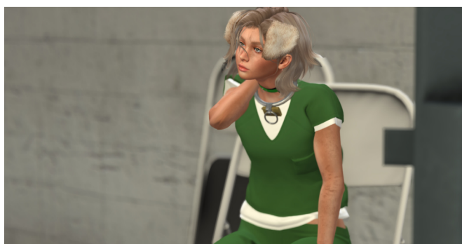
...Cookie waits. [Photo: Cookie]