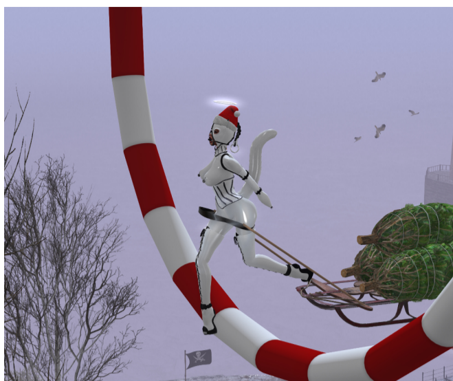
Tessa flies like a reindeer!

can receive the rare "Squeak!" Stoa achievement pin!