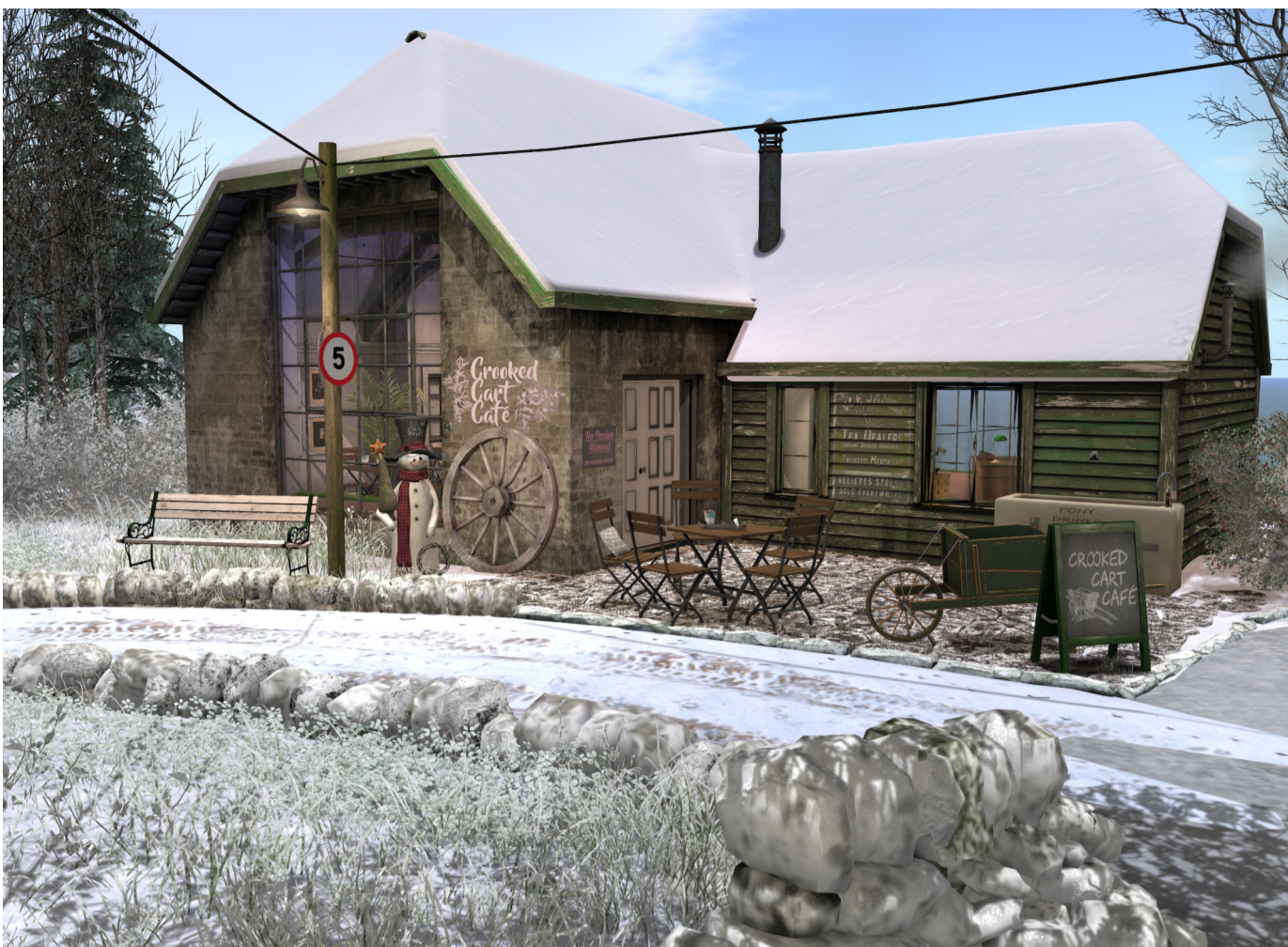
The new Crooked Cart Cafe next to the transport hub