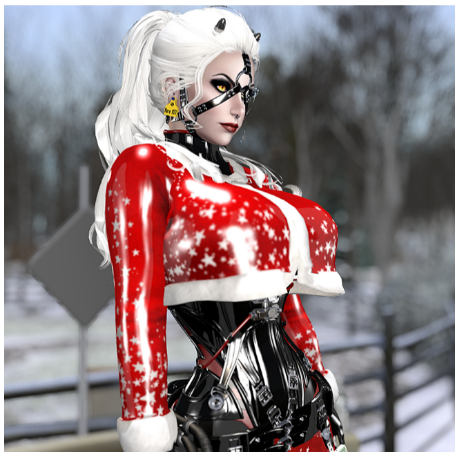
Mama Moo Mare in the Xmas spirit!