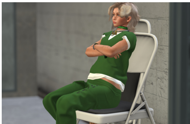
Meanwhile in the Ponizei cell...